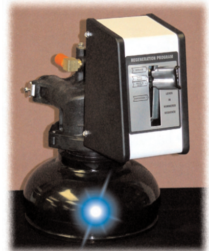
MANUAL VALVE PICTURED *OPTIONAL*

All components are manufactured from the finest raw materials available and carry one or more of the following validations to insure system function and integrity: NSF Certified, FDA Approved, UL Listed, CE, CSA, BSI, TUV, ANSI Approved.